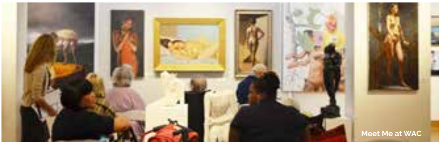
Meet Me at WAC

We invite those with Alzheimer's or dementia and their caregivers to tour our galleries once a month to experience close up art, followed by discussion and a simple creative project. Exchange ideas about art, make connections to personal experiences and memories, and create art related to the exhibition to take with you. Register early-space is limited to 8 plus, caregivers.