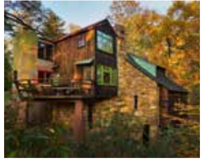
Wharton Esherick Studio

Join us for a private tour of the home studio of the ingenious woodworker who crafted all the contents of his home. Lunch at Terrain Cafe, Devon Yards